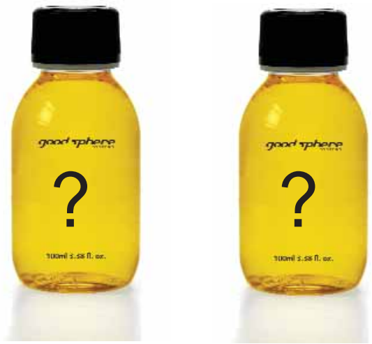
Spring Limited Editions To be announced shortly www.goodsphere.co.uk

There are many more exciting new products and essences coming your way in 2008, including the Goodsphere Essence Club!