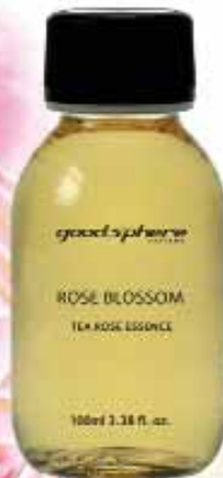
Rose Blossom Tea Rose Essence