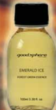
Emerald Ice Forest Green Essence