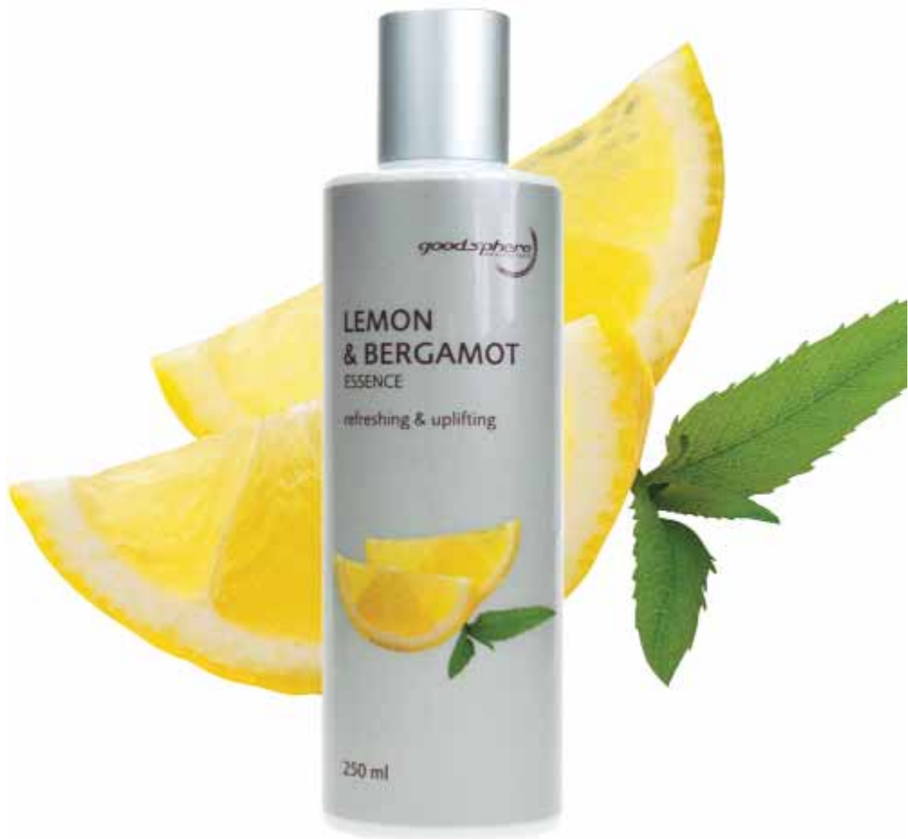
Lemon & Bergamot Essence