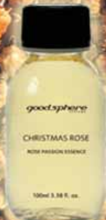
Christmas Rose Rose Passion Essence