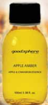
Apple Amber Apple & Cinnamon Essence