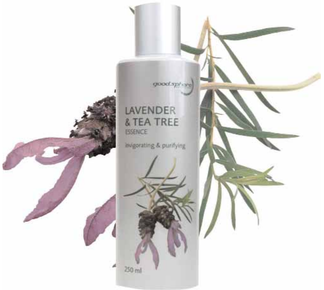
Lavender & Tea Tree Essence