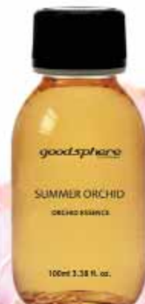
Summer Orchid Orchid Essence