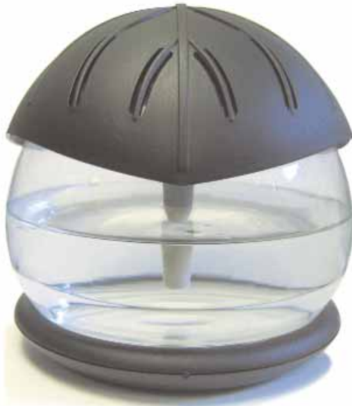
Return of the 'Groove' Spectrum Combo