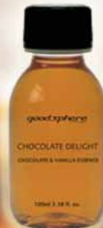
Chocolate Delight Chocolate & Vanilla Essence