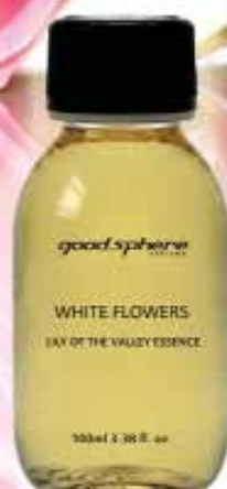
White Flowers Lily of the Valley Essence