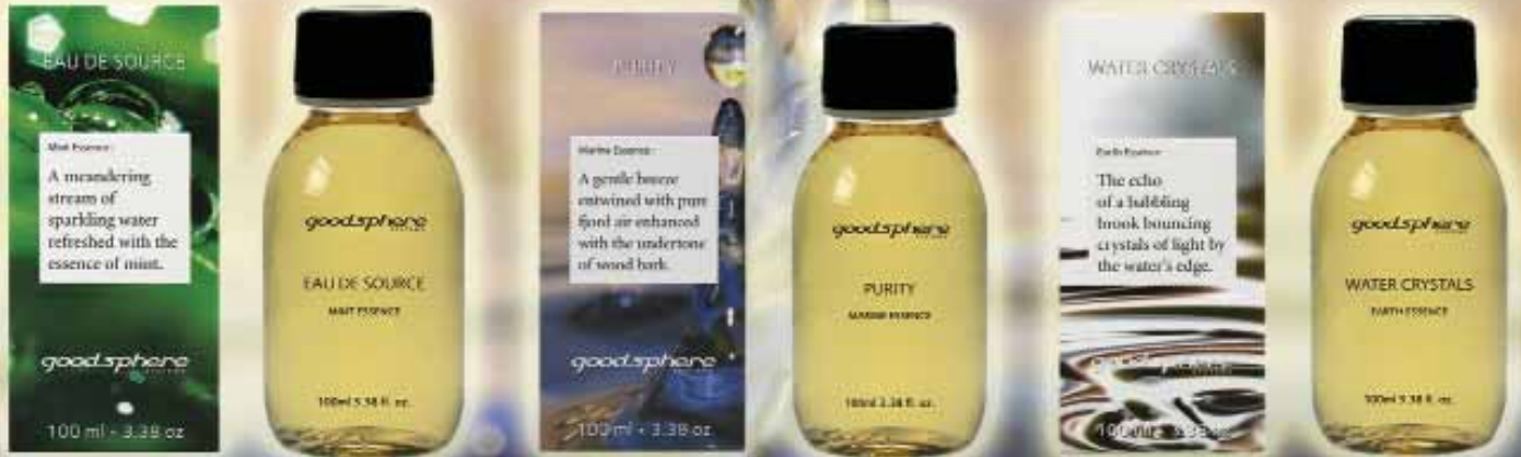
Eau De Source Mint Essence