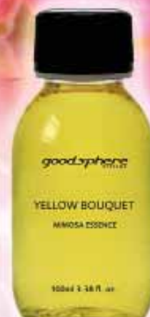
Yellow Bouquet Mimosa Essence