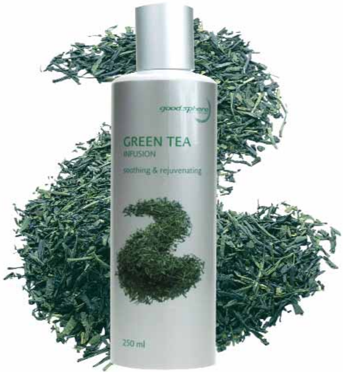
Green Tea Essence (Coming Soon)